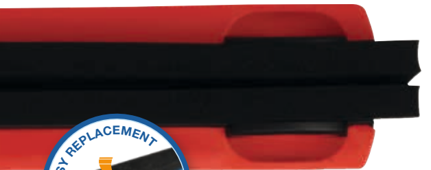
Classic double bladed